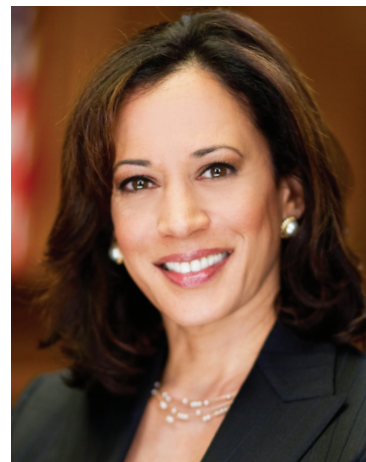
ATTORNEY GENERAL KAMALA D. HARRIS